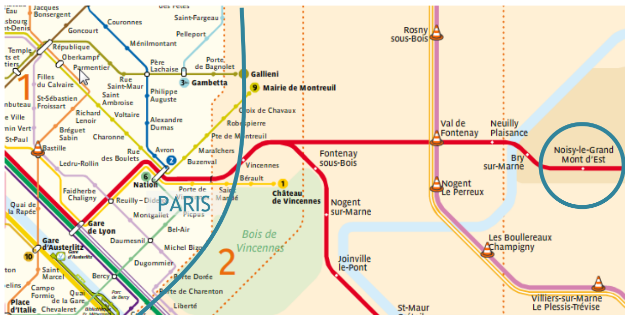
Map 4 - The A-line between “Noisy-le-Grand Mont d’Est” and Paris:

http://www.ratp.fr/plan-interactif/ or http://www.ratp.fr/en/